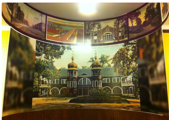
The alcove at the entrance to the rest rooms features reproductions of post cards of Electric Park.

The remodeled rest rooms are almost complete! Be sure to check out the museum's amazing new custom rest rooms. Thank you to our carpenter Monte Smith for excellent work and to long time museum supporter