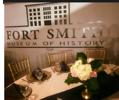
2nd floor event room.