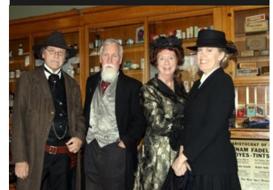
Murder and Mayhem