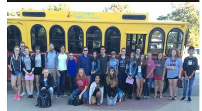
German Exchange Students